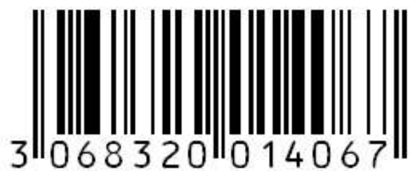
Evian 0.5L Mineral Water