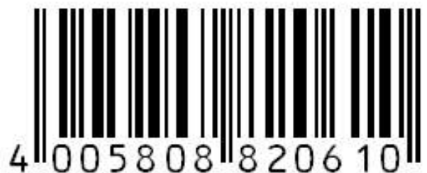
Atrixo Hand Cream 75ml.png