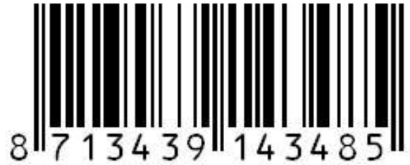
650W Power Supply